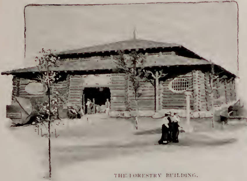
THE FORESTRY BUILDING.

power sent here in fragile human forms to rule the falls, and other manifestations of crude power, regulate nature and do the work of embellishing and cultivating the globe.