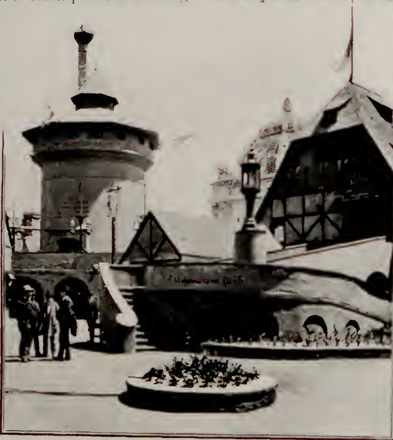
THE WALL AND TOWERS OF ALT NURNBERG.

But this has led us from our small, tiny-faced friends in the rows of incubators.