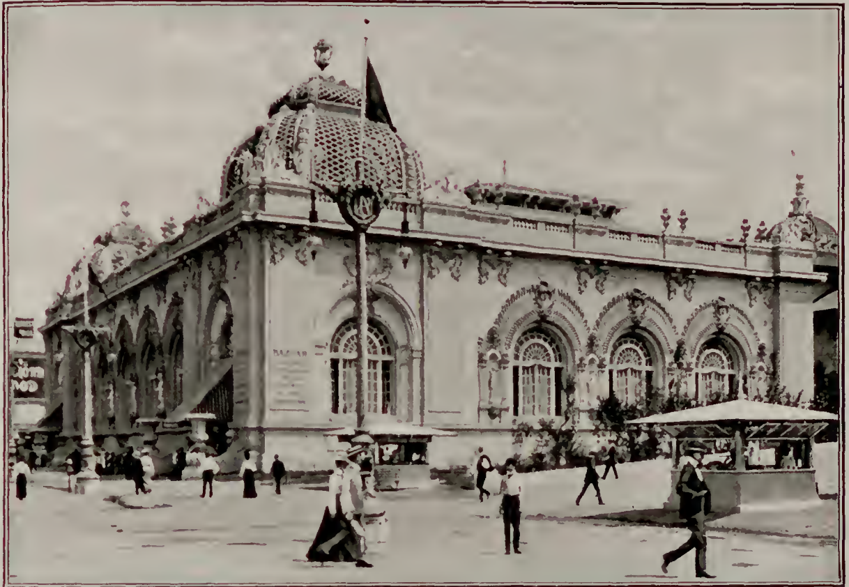
THE BAZAAR BUILDING.

One triplet with the right start, education and incentive might give you the wealth of a Rothschild and enable you to buy, without feeling the outlay, all the