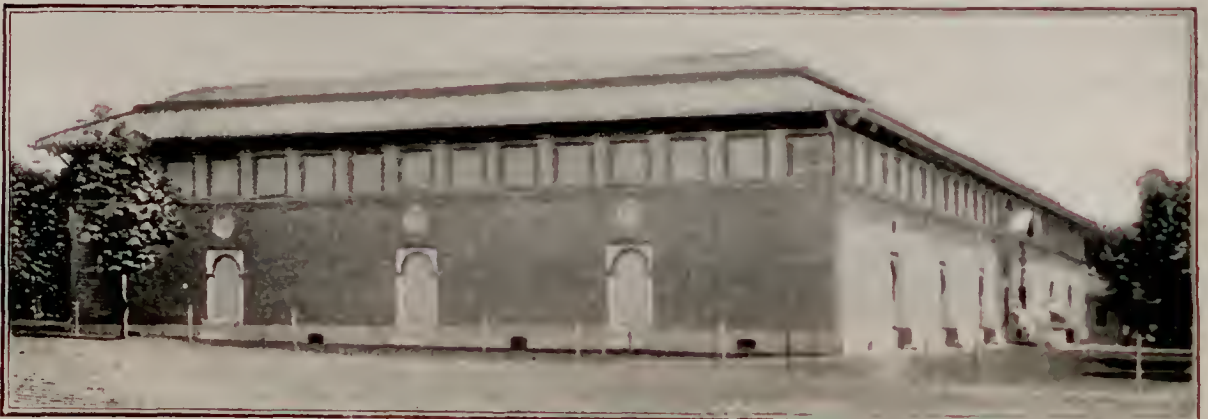
THE ARTS BUILDING.

To-day the German baby is doing well. It is as heavy as its competitors on the block and will live to do its share of the world's hard work. It will do infinite good, should the story of its advent here below impress upon mothers the fact that building up the baby's body involves keeping its brain quiet.