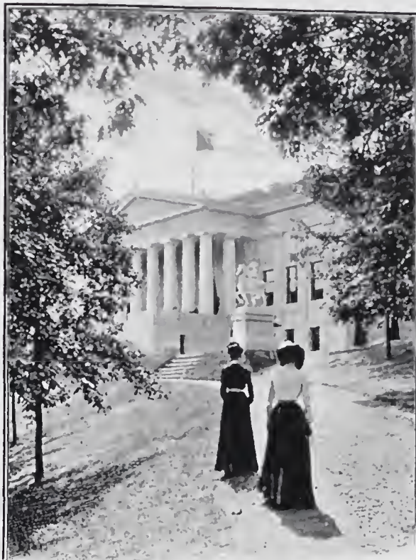
THE APPROACH TO THE NEW YORK STATE BUILDING.

will persist, and affect men's destiny, when the falls, working their own ruin, shall have dwindled down to an even, placid stream without so much as a ruffling of the water to tell where once the great power rushed by.