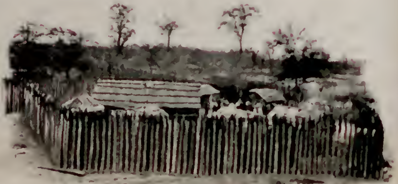
THE SIX NATIONS VILLAGE.

The baby in the incubator is born into a world of trials and troubles before his appointed time. For that reason science provides for him in the incubator a home as like as possible in temperature and other conditions to that which he has hurriedly abandoned.