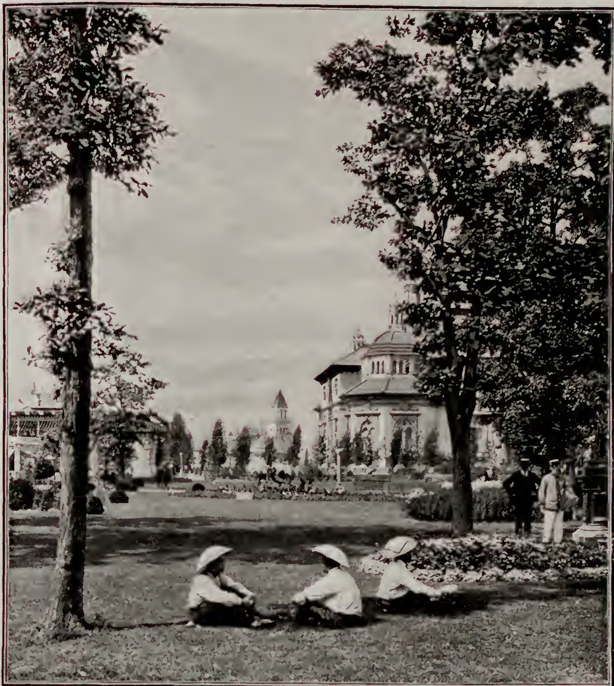
RICKSHAW-MEN RESTING IN THE GARDENS.

Hot air, cleanliness, a soft bed and good food satisfy him.