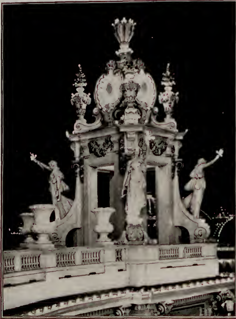
A BIT OF THE ELECTRIC TOWER.

Mothers blessed with healthy children normally born should learn from the German baby's narrow escape to let their children's minds rest as long as possible, while the body gets its start. Nature sets the example by making the baby deaf for a long time after birth. Mothers and nurses often do not know even this.