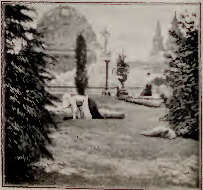
WEEDING THE GARDENS.

He is moved from his nest of heated air, carefully wrapped in woolen coverings. He is weighed, fed as nature intended he should be fed, weighed again and put back to resume his interrupted, sleepy contemplation of the infinite. If he does not weigh enough, he is persuaded in various ways to absorb more nourishment. His life is regulated, and, unlike older mortals, he is contented that it should be regulated.