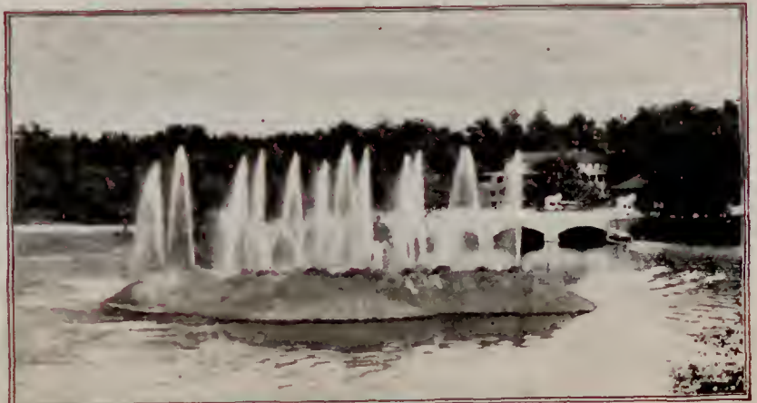
AN ISLAND OF FOUNTAINS.

An agitated infantile brain exhausts the blood-supply, takes heat from the stomach, where it should be, to the brain, where it does harm, and kills off millions of children.