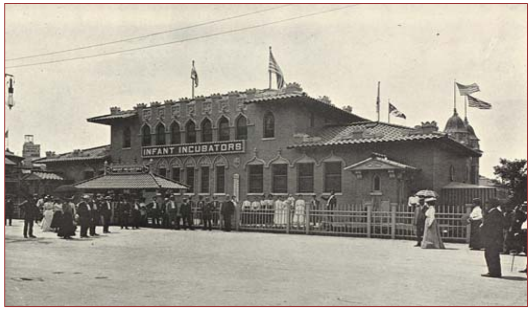
The Infant Incubator Building with "a constant stream of people going in and out."